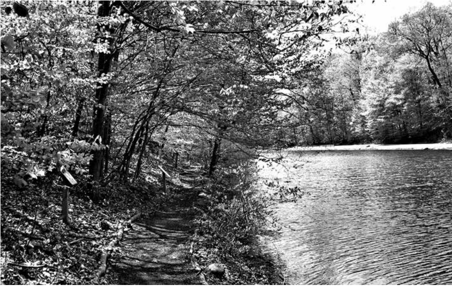
At the pond.

lot to a fishing pier and then parallels the road behind a wooden barrier. It ends at a pull out for 3-4 cars south of the lake. The 9/11 Trail goes 0.1 mile to a memorial to the town residents killed in the attack on the World Trade Towers. An unmarked fire access road goes 0.2 mile to the cul-de-sac at Barnes Lane.